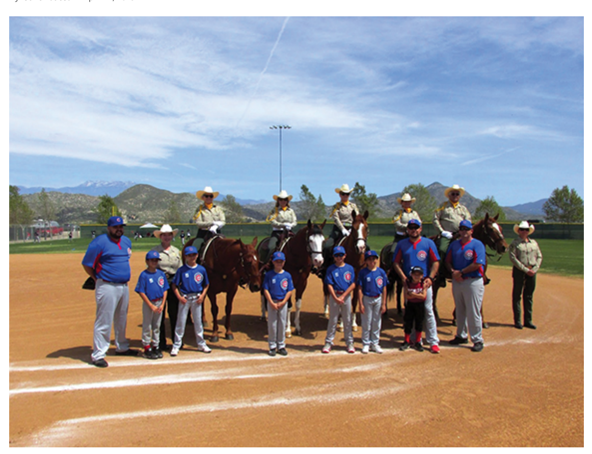
The Cubs pose with the Riverside Sheriff's Colorguard.