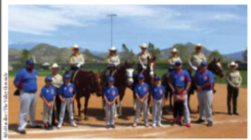
The Cubs pose with the Riverside Sheriff's Colorguard