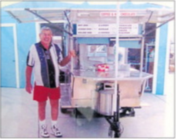
ents across the San Jacinto Valley, where he was known as the "Hot Dog Cart Man."