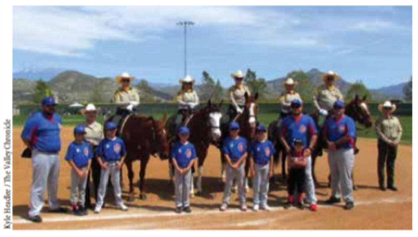
The Cubs pose with the Riverside Sheriff's Colorguard