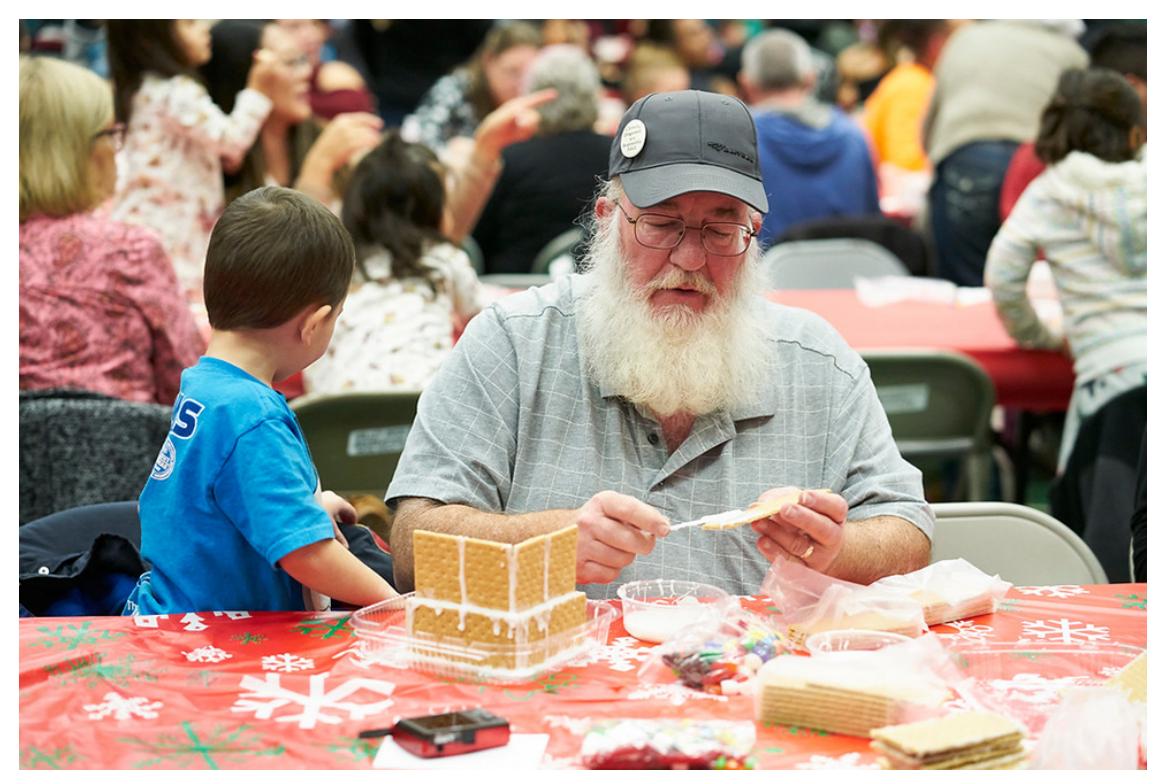
Families can create gingerbread houses at three Valley-Wide Recreation and Park District events in December.

With Santa's arrival expected soon, Valley-Wide Recreation and Park District is preparing special holiday events at its San Jacinto Regional Park and three community centers beginning Friday, Dec. 6.