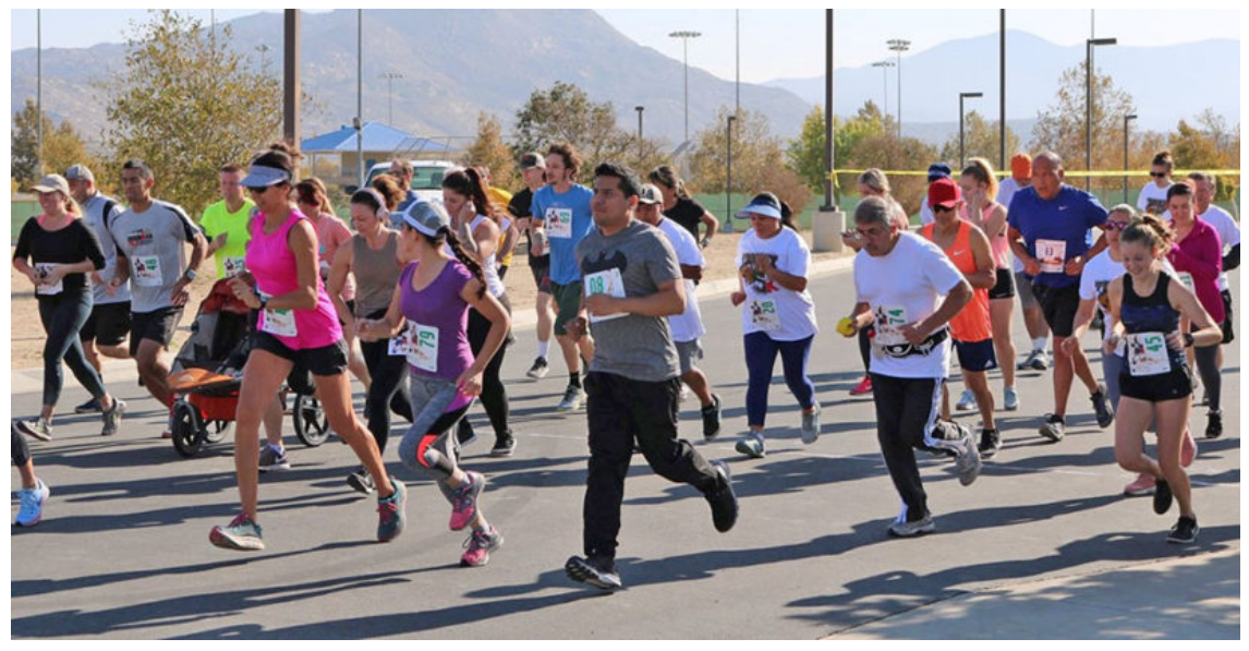
Participants compete during the 2018 Turkey Trot 5K Family Fun Run. The 2019 event will take off running Saturday, Nov. 23, at Diamond Valley Lake Community Park in Hemet.

HEMET – Registration is underway for the annual Turkey Trot 5K Family Fun Run which will take place Saturday, Nov. 23, at Valley-Wide Recreation and Park District's Diamond Valley Lake Community Park in Hemet.