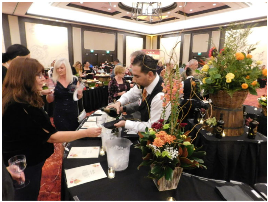
Tasting pourer fills the wineglass of a customer with a fine wine during the 27th annual Autumn Elegance Wine and Food Tasting event at the Soboba Casino Resort and Hotel's events center, Saturday, Nov. 2, in San Jacinto. The event, presented by Hemet San Jacinto Exchange Club and Friends of Valley-Wide Foundation, benefits Valley-Wide Recreation and Park District programs in its many parks.