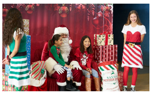
Visits with St. Nick is among the activities during Breakfast with Santa Saturday, Dec. 14, at the Sport Center at Regional Park in San Jacinto.